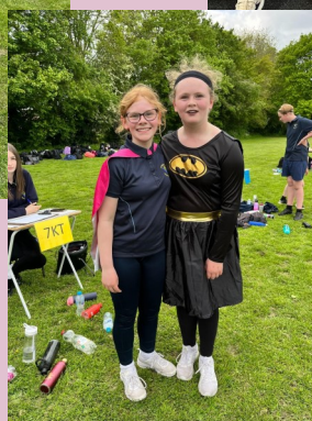
Sponsored Walk/Run Year 7